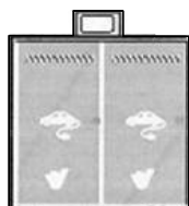
Electric Vehicle Charger Parking Bays & Charger Configuration