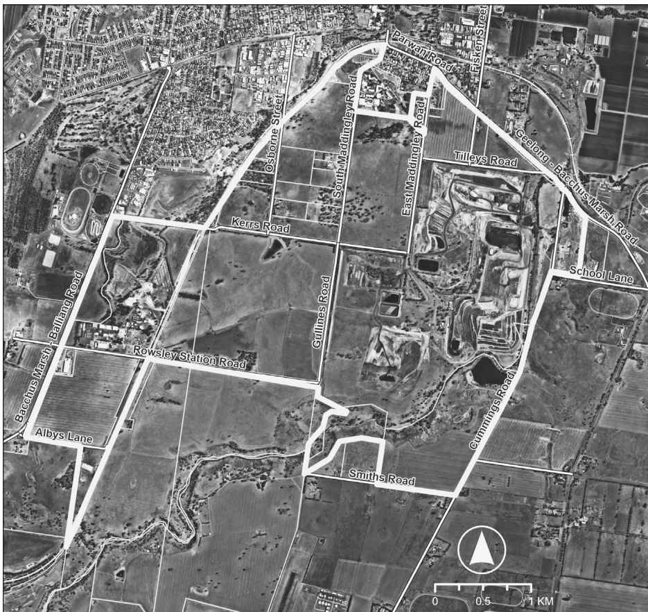
Figure 1: Maddingley Framework Plan area

The land affected by the Amendment is outlined in Figure 1.